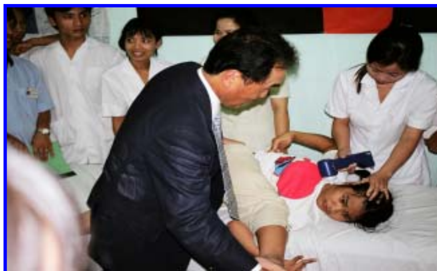
Photo 2: Professor Toshio Ohshiro treated children with dioxin and showed doctors how to use the laser machine.